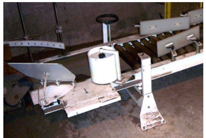
Typical Dimensions Shown, Equipment Manufactured To Suit Each Installation.