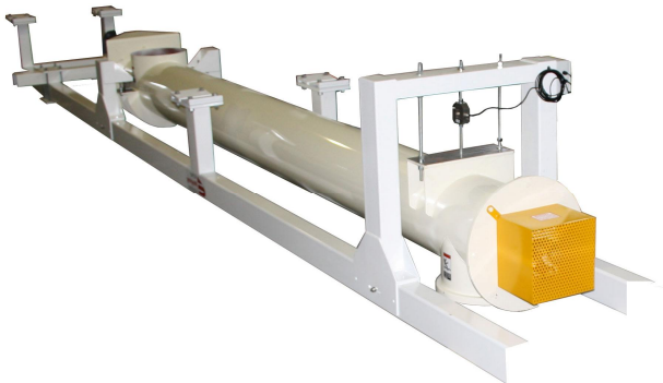
Malt Bulk Outloading Pivoted Weigh Screw Conveyor