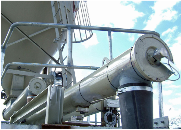
Cement Pivoted Weigh Screw Conveyor