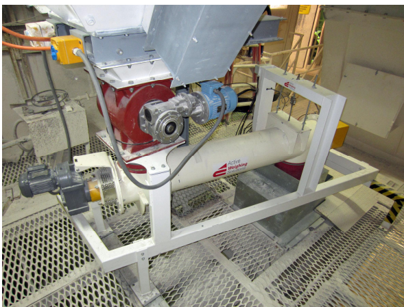
Hydrated Lime Screw Feeder